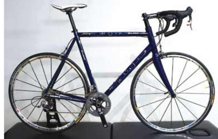
Each frameset is hand-painted